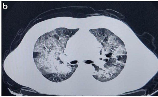
Figure 1a and b: Chest radiograph depicting alveolar infiltrates and ground glass opacity in both lungs (a), CT chest depicting diffuse ground glass opacity of bilateral lungs, patchy consolidation, and nodular septal thickening (b)